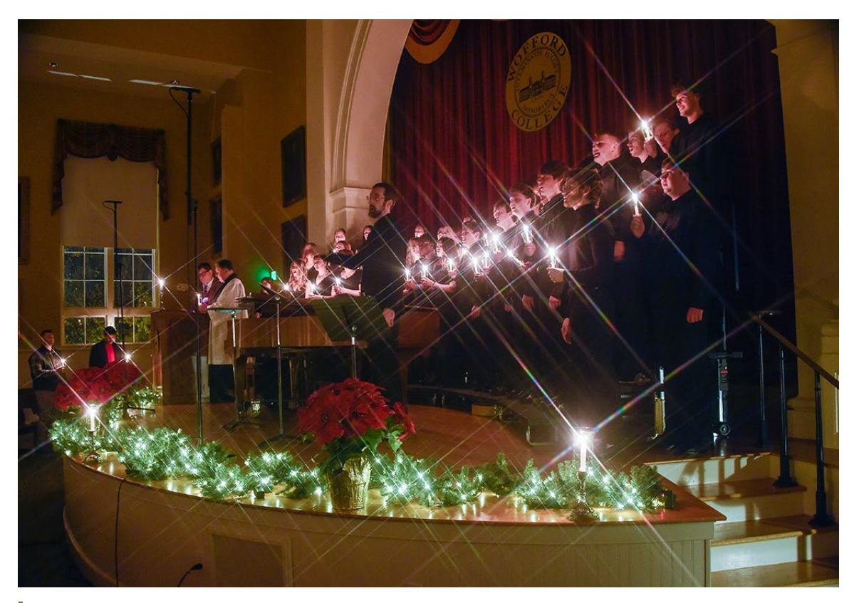
The college's annual Candlelight Carols and Lighting of the Menorah was held Dec. 6 in Leonard Auditorium.

The holiday season is officially underway at Wofford College. The college's annual Candlelight Carols and Lighting of the Menorah was held Dec. 6. All student choirs performed.