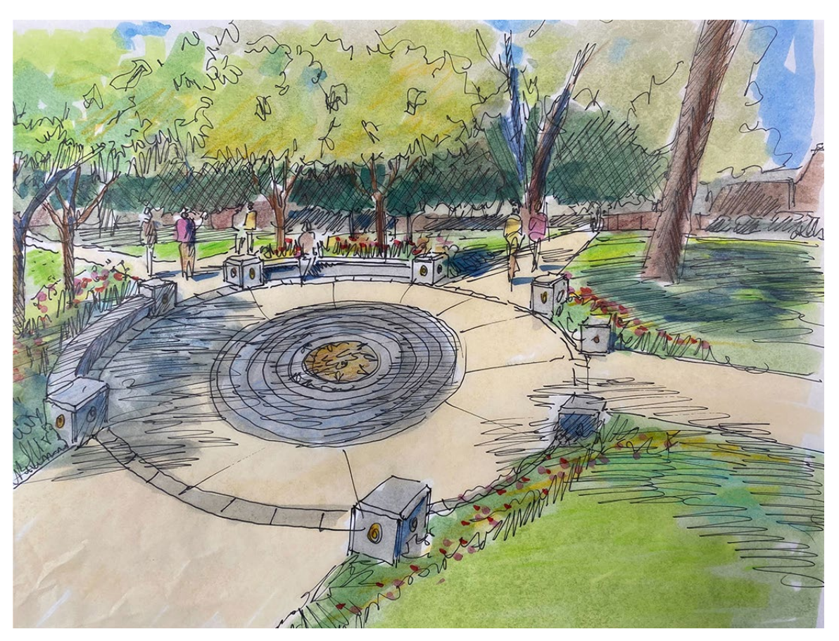
Plans are underway for a military memorial to honor alumni who died on active duty.

Since ROTC's establishment on campus in 1919, 101 Wofford alumni have died while on active duty during World War I and World War II, as well as during wars in Korea, Vietnam and the Middle East.