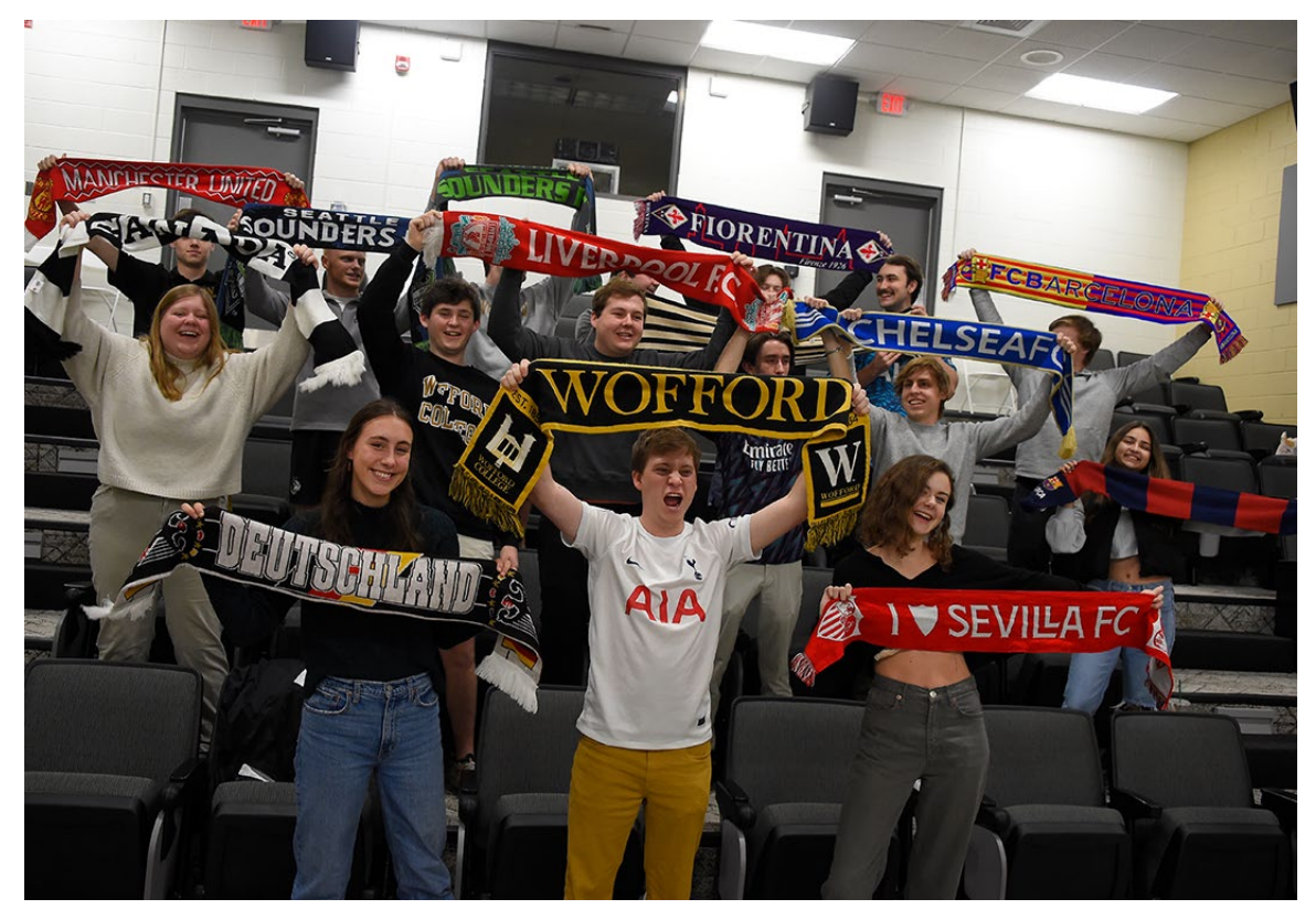
Students got to experience many aspects of the show, "Ted Lasso," including why scarves are important to soccer fans.