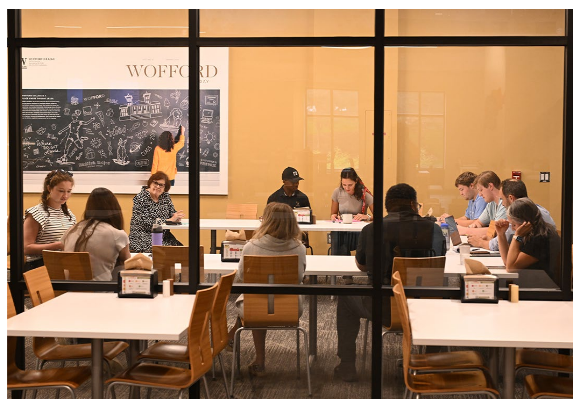
In 2029, Wofford will celebrate its 175th anniversary. In preparation for this milestone, the campus community has spent the fall semester considering innovations of the past and imagining an even brighter future. You can help.

Institutional excellence is driven by aspirational thinking, and college leaders would like alumni, parents and community partners to help students, faculty, staff and trustees think broadly and strategically about the future. Visit Wofford.edu/priorities to learn more about the process.