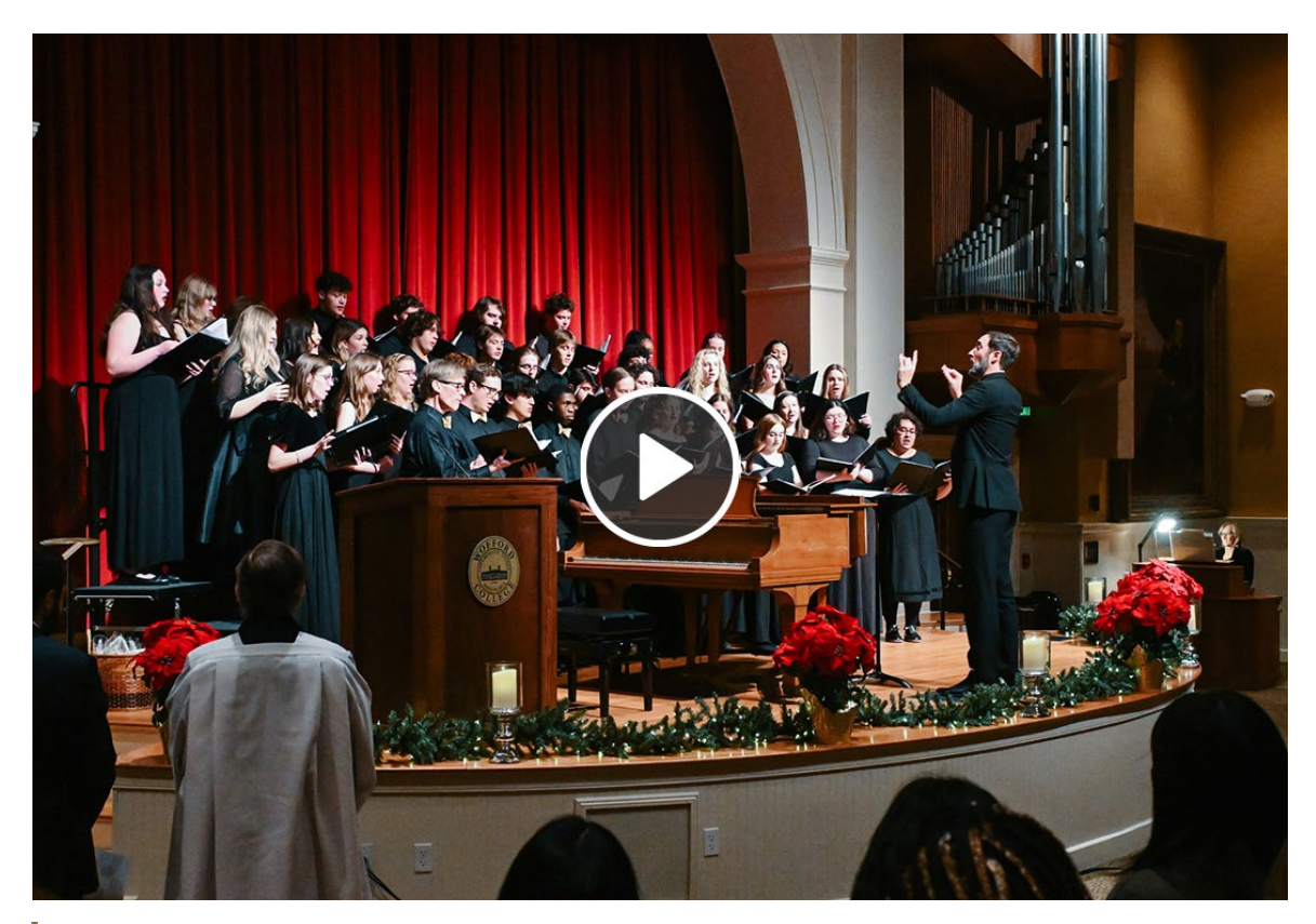
Enjoy talented student-musicians and the readings of students who support the work of the chaplain's office.

Each year the college celebrates the start of the holiday season with the traditional Candlelight Carols and Lighting of the Menorah. The performance was livestreamed for those who could not attend and is now available to watch on YouTube.