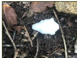
White quartz Morrow Mt. point, named for the NC place where this style was first described

Join us as we put shovels and minds to work, piecing together new pictures of our fascinating past! Interim sign-ups are next week.