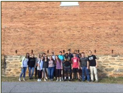
ENVS 450 Senior Seminar enjoyed their first class of spring semester at Glendale.