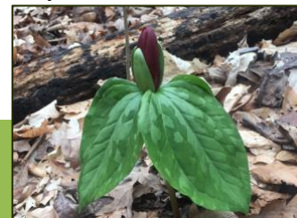
Top left: coyote tracks at the upper shoals Middle: red bellied water snake Bottom: recently built boardwalk Right: Trillium blooming on the upper shoals trail