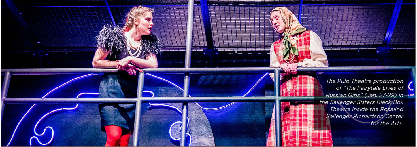
The Pulp Theatre production of "The Fairytale Lives of Russian Girls" (Jan. 27-29) in the Sallenger Sisters Black Box Theatre inside the Rosalind Sallenger Richardson Center for the Arts.